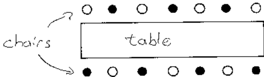
Figure 2: Real-world ménage problem.

it not for this tradition, it would not have taken half a century to discover Touchard's formula for M_n . Of all the ways in which sexism has held back the advance of mathematics, this may well be the most peculiar. (But see Exercise 2.)