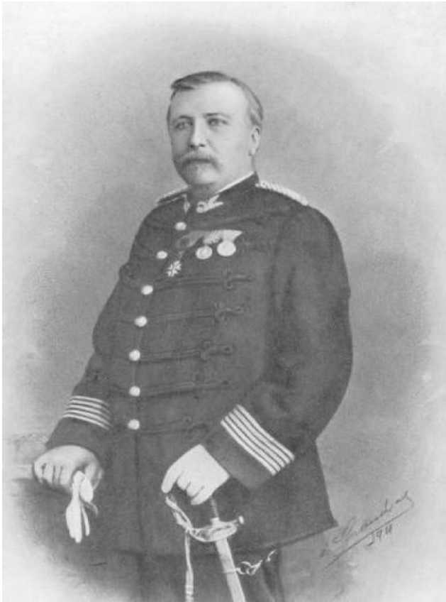
Fig. 2. Henri Auguste Delannoy (1833–1915).